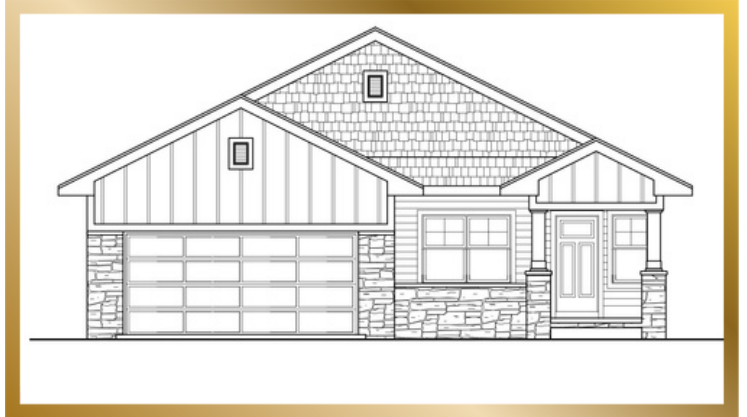
ELEVATION 2 - CRAFTSMAN